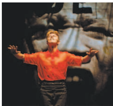
The artistic side of David Bowie is spotlighted in the film "Moonage Daydream."

Morgen, who calls himself an "intellectual midget" compared with Bowie, shares that