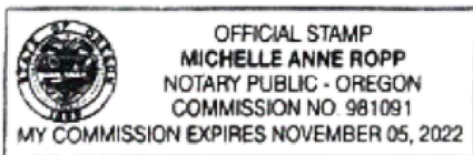
Notary Public-State of Oregon